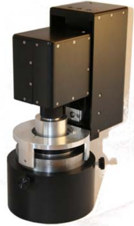
Bushing Scanner BSH 1.5